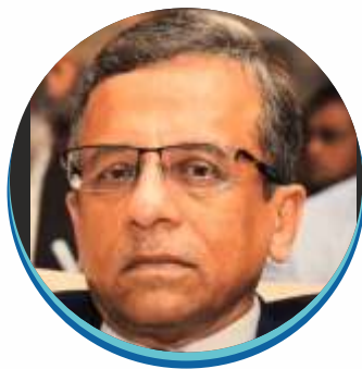
Course Director Pakistan