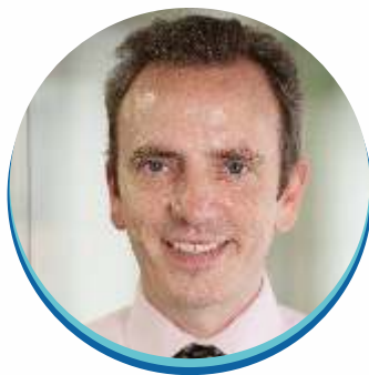
Course Director London

We deliver a wide range of projects aimed at strengthening health systems and improving medical standards across the globe. Our work spans high-, middle- and low-income countries, ranging from clinical skills workshops in rural Nigeria to accreditation work and guideline development in the Middle East. We also develop and coordinate the globally-recognised MRCP(UK) exams as part of the Federation of the Royal Colleges of Physicians.”